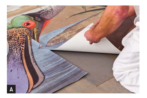
Page 2 of 3